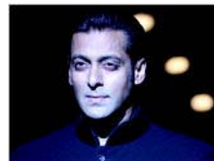
Salman Khan Join Fanclub Galleries | Downloads