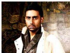
Abhishek Bachchan Join Fanclub Galleries | Downloads