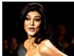
Sushmita Sen Join Fanclub Galleries | Downloads